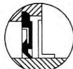
SL TYPE SEAL