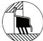
L3 TYPE SEAL